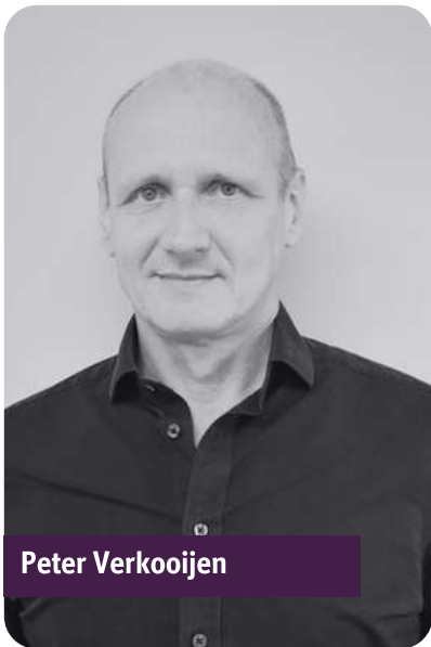
Conference Producer, WORKTECH Events