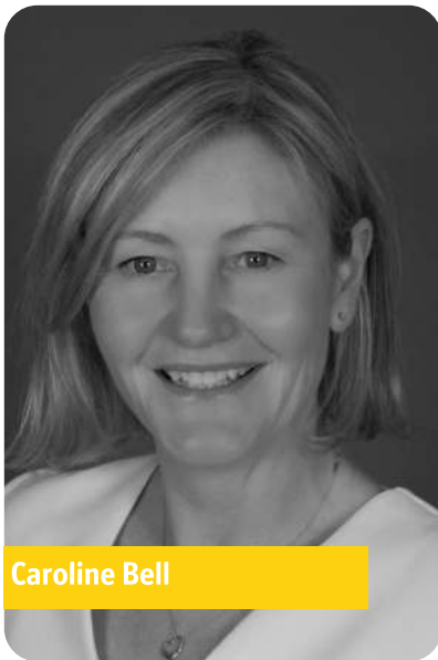
Managing Director, WORKTECH Events