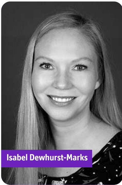
Managing Director, WORKTECH Events