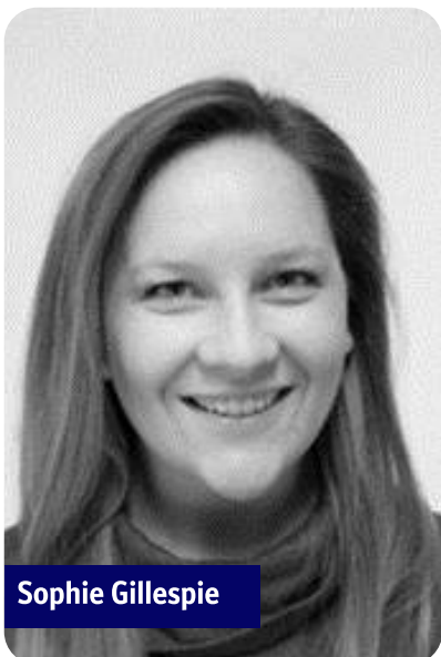
Conference Producer, WORKTECH Events